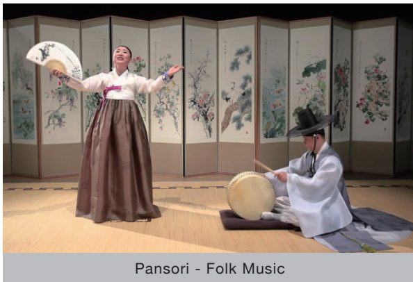
Pansori - Folk Music

Religious music is based on Buddhist and native shamanistic rituals. One example of Music on a Korean stage Korean religious music is Sinawi or Shinawi, which is music improvised by a musicians ensemble during shamanistic rituals.