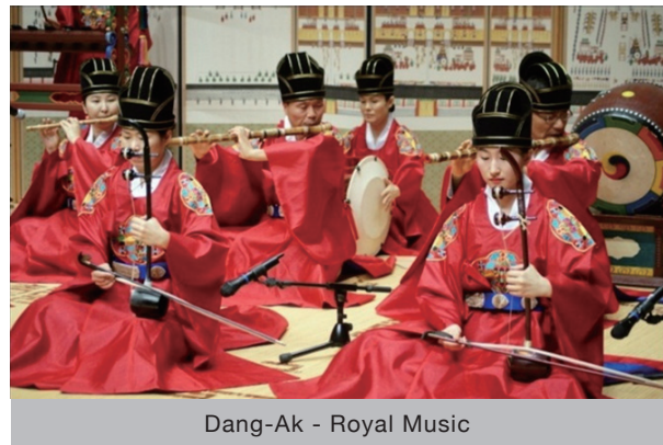
Dang-Ak - Royal Music